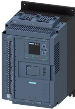
SIRIUS soft starter 200-480 V 93 A, 110-250 V AC Screw terminals